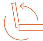
Adjustable signal direction