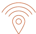
Extended Flight Range