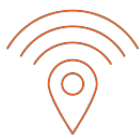
Extended Flight Range