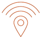
Extend flight range